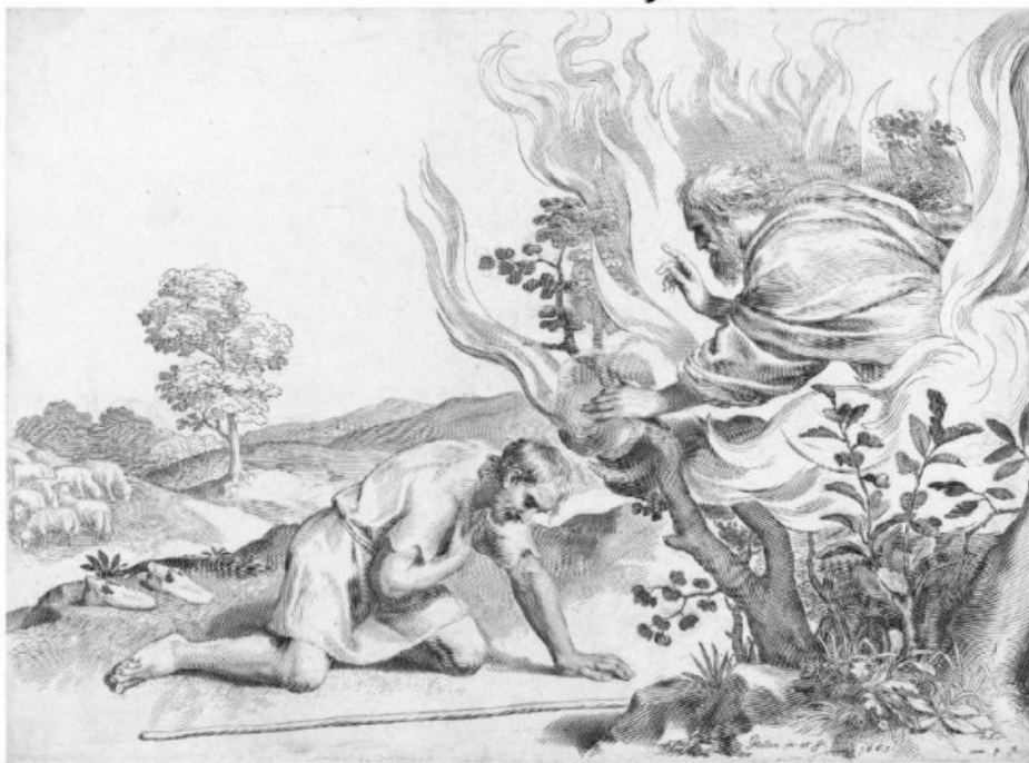
Moses and the Burning Bush by Claude Mellan

"I am the God of your fathers," he continued, "the God of Abraham, the God of Isaac, the God of Jacob.""