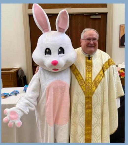
Easter Triduum 2024 Prince of Peace Parish