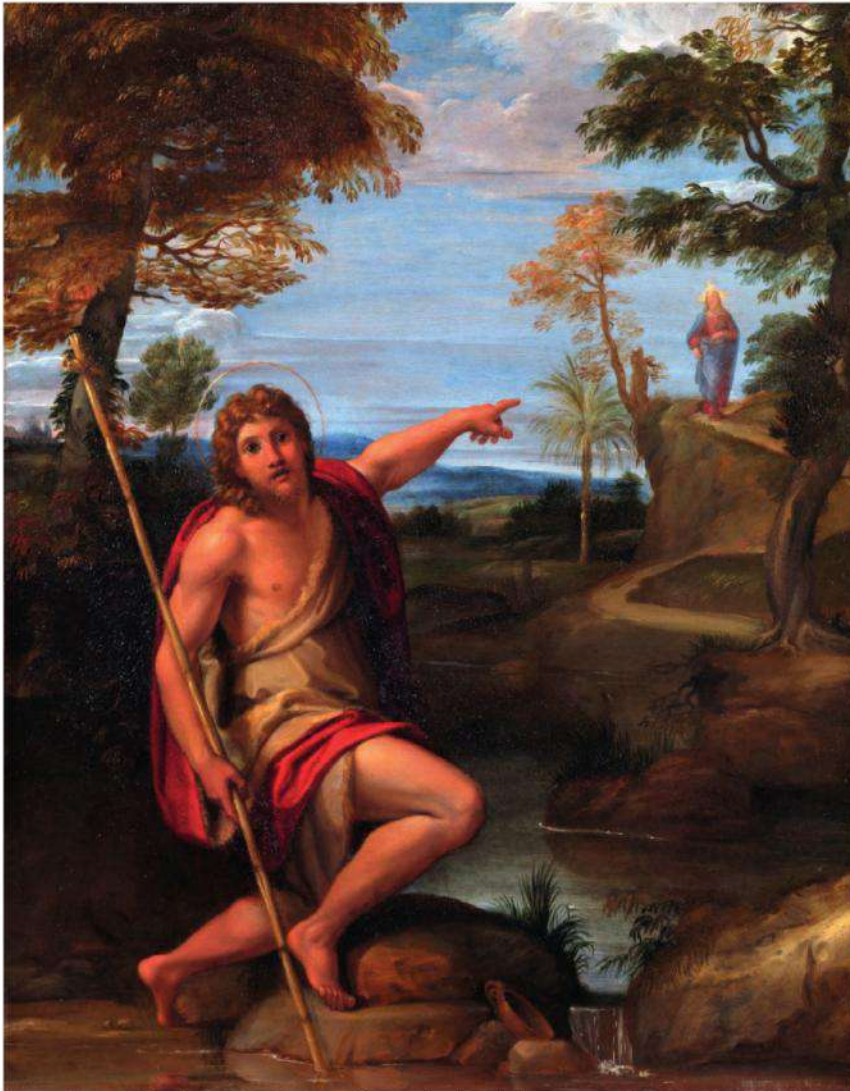
Image: Saint John the Baptist Bearing Witness by Annibale Carracci